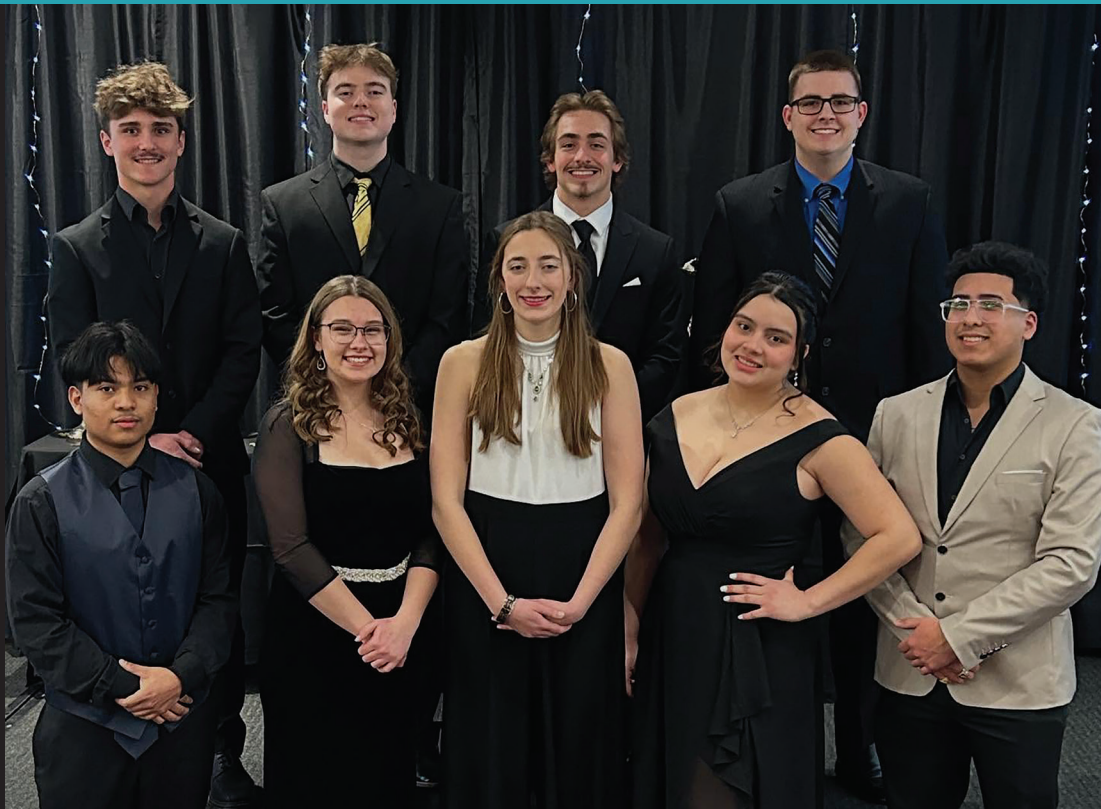
2024-2025 KCEO Class at their KCEO Gala (February 2025)

Creating Entrepreneurial Opportunities in Kandiyohi County